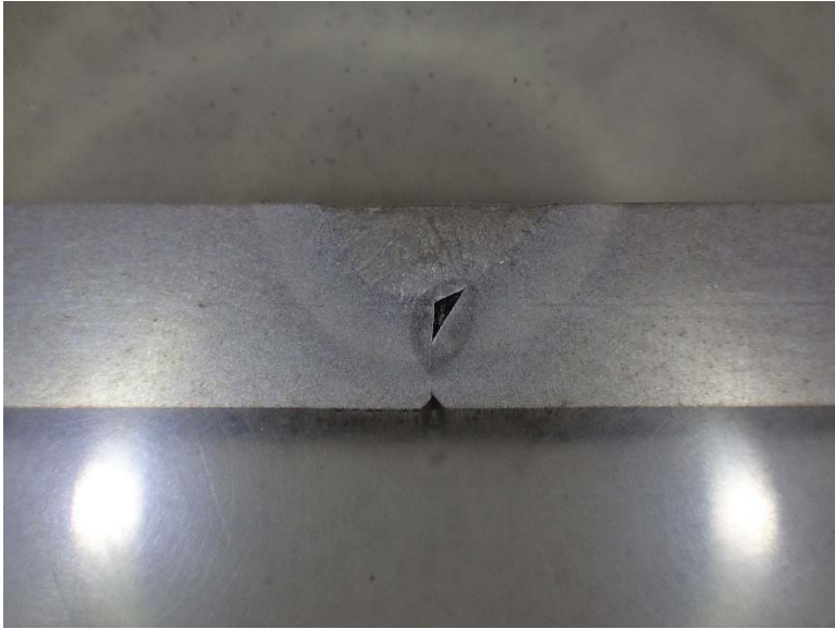
Figure 1: Welded A36 mild steel immersed in a freshly mixed ammonium persulfate solution for 1 minute. The sample surface was mirror polished.